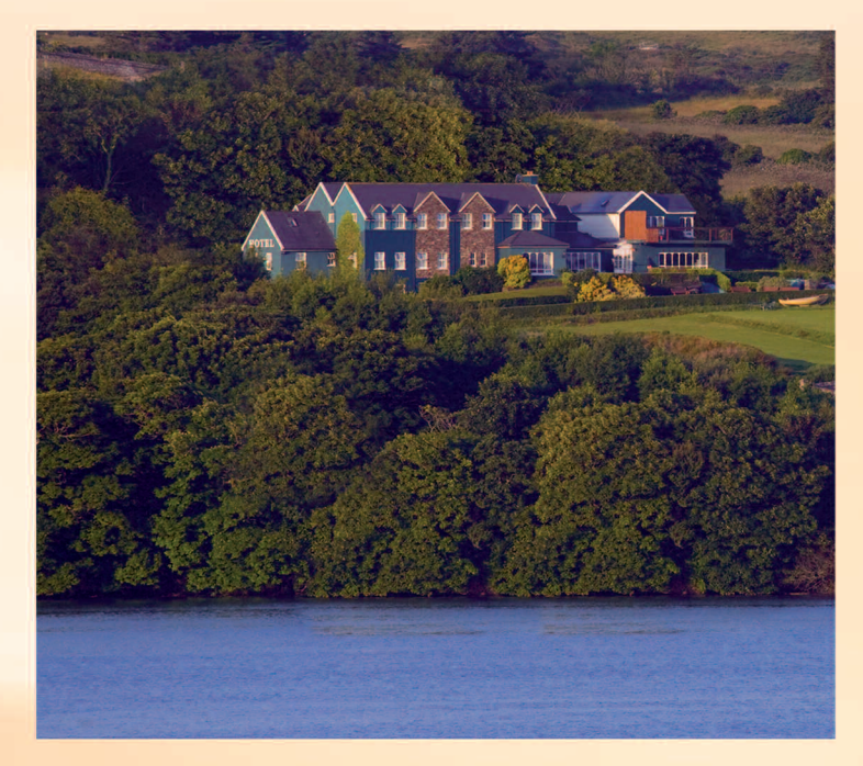
CASEY'S OF BALTIMORE

Terms and conditions will be outlined by our wedding co-ordinator in detail when you call to book your wedding.